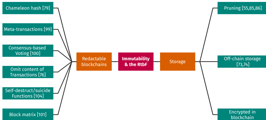
Fig. 2. An overview of solutions for balancing immutability and the Right to be Forgotten.

at a given point in time will remain in the blockchain. Bearing in mind that by using the stored hash alone the original content cannot be reconstructed, this workaround seems to resolve the blockchain's immutability collision with the RtbF rather elegantly. Indeed, off-chaining techniques so far are considered to be key tools in blockchain-based application engineering as they present significant benefits, such as reduced blockchain data storage requirements, and hence fewer scalability issues, and GDPR compliance [73], [55]. As a matter of fact, a recently conducted study [59] among experts concluded that blockchains could be indeed compliant with the privacy by design principles of the GDPR, and consequently with the RtbF, by employing these kind of off-chaining techniques. On the downside, however, these techniques move the responsibility of robust, distributed data storage to other protocols like the IPFS [75], while they introduce complexity and additional delays. Furthermore, they have been criticised for decreasing blockchains' security by introducing more attack vectors [76], [77]. But most importantly, these solutions do not avoid the burden of having to remove the hash pointers from the blockchain since hashed data are pseudonymous, not anonymous, and therefore need to be protected [65]. For instance, hashed data may reveal sensitive personal information either when combined with other available information or when they are subject to dictionary attacks.